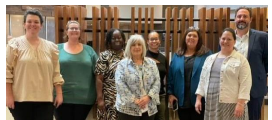
ADRS TBI Program and TBI Grant Staff members posing for a picture at the TBI Summit