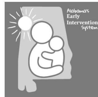
Reverse – grayscale