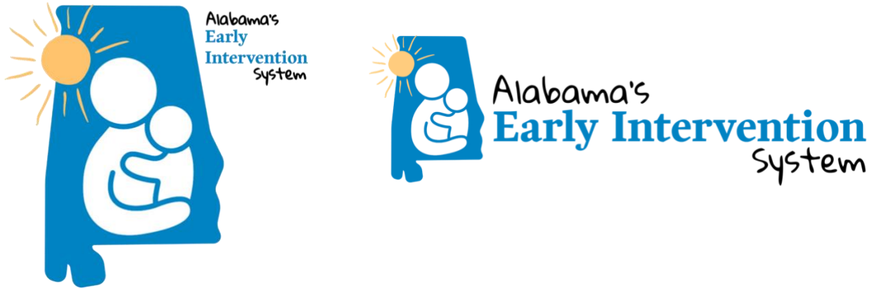
Full-color logo, vertical and horizontal versions

In all applications, the logo color must be consistent; the approved color codes for printing and reproductions are listed at the bottom of this page.