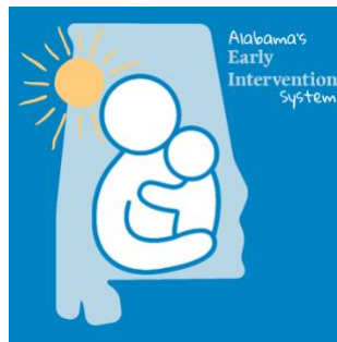
Reverse – color